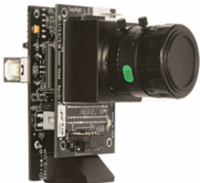
Illustration only. See data sheet for product specifications.